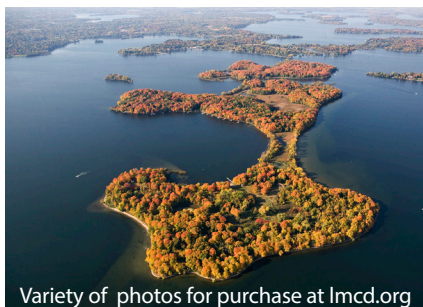
Variety of photos for purchase at lmcd.org