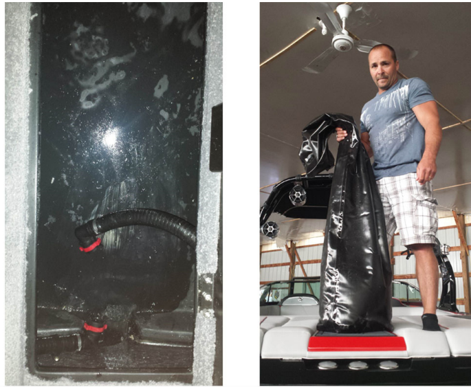
Figure 2. A ballast bag is pliable and collapsible, and often has two connected hoses in order to fill and drain the ballast (left). It was observed that the hoses could lift the drain connection above the lowest part of the ballast bag, resulting in a significant amount of residual water in the ballast bag (right). A hard ballast tank (bottom) fills an entire compartment, even when not full, and is generally inaccessible without tools.